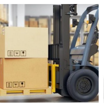
Less Than Truckload